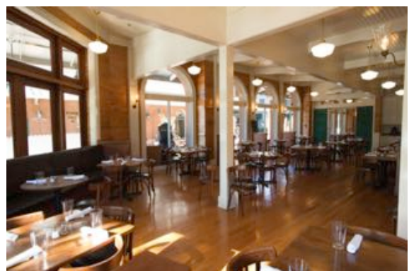
Interior view of the Grand Isle Restaurant, New Orleans, Louisiana

New Orleans' distinctive architecture, music, and food all contribute to the city's unique culture. Plan to join your ANS friends, old and new, at The Grand Isle Restaurant on Saturday, January 4, 2020 at 7:00 p.m. for the 2020 ANS Banquet. The Grand Isle Restaurant, located at 575 Convention Center Blvd, New Orleans, is the ideal venue for our annual celebration. Not only do food critics consider the Grand Isle to be one of the best restaurants in the Warehouse District, it was recently recognized as one of New Orleans' 10 best oyster bars. It's also a convenient two-block walk from the convention hotel.